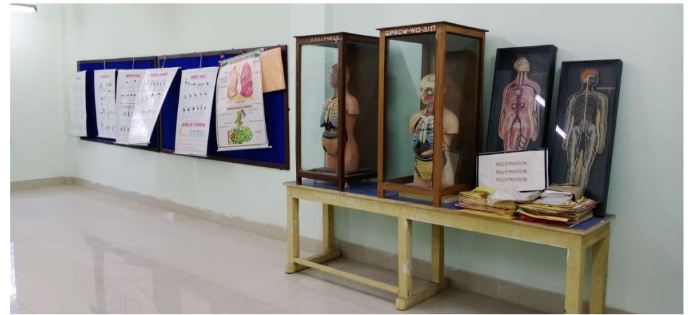
AUDIO VISUAL ROOM-2