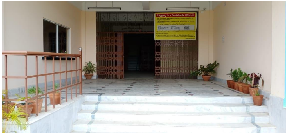
FRONT GATE OF THE COLLEGE