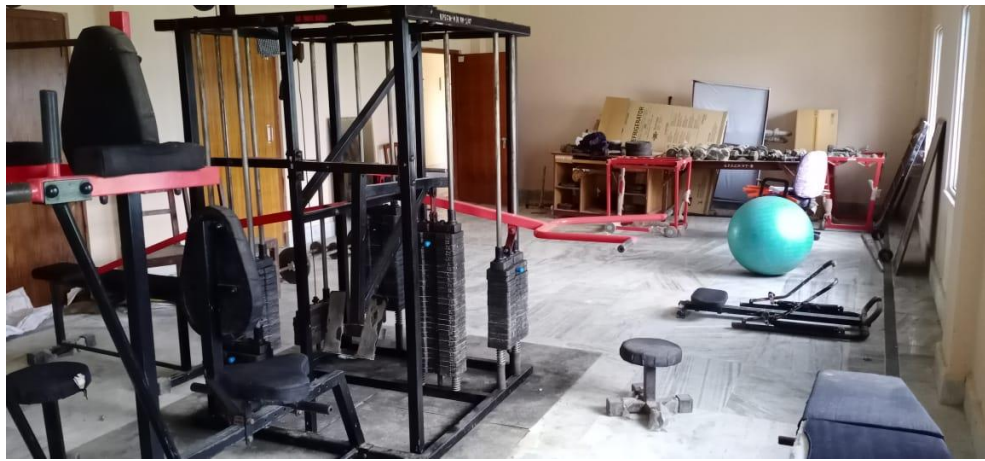
MULTIGYM AND EXERCISE ROOM