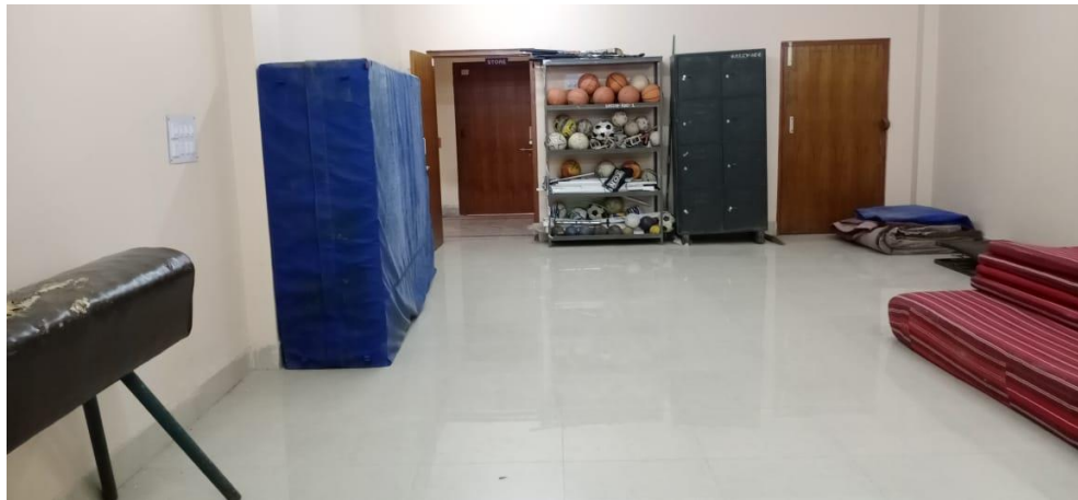
GYMNASIUM - 2