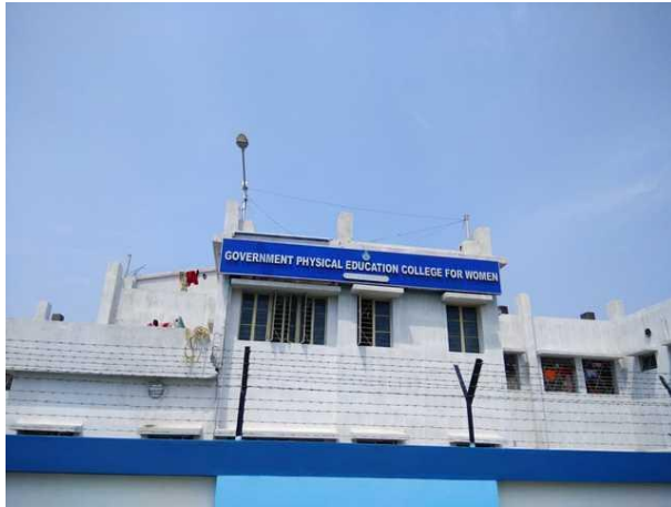
GIRL'S HOSTEL FRONT