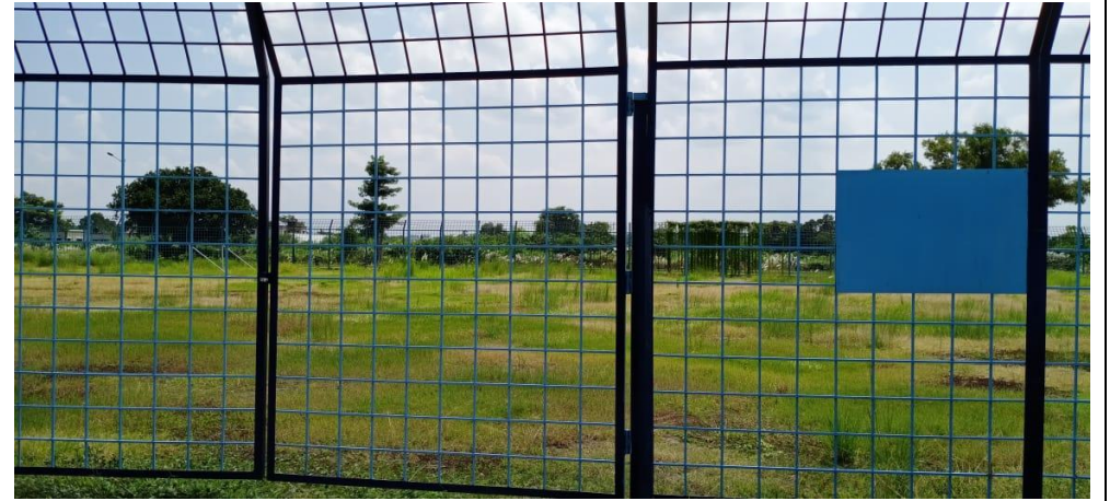
MULTI PURPOSE PLAYGROUND