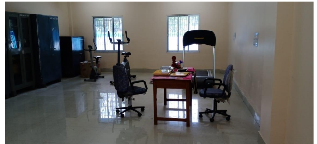
HUMAN PERFORMANCE LAB