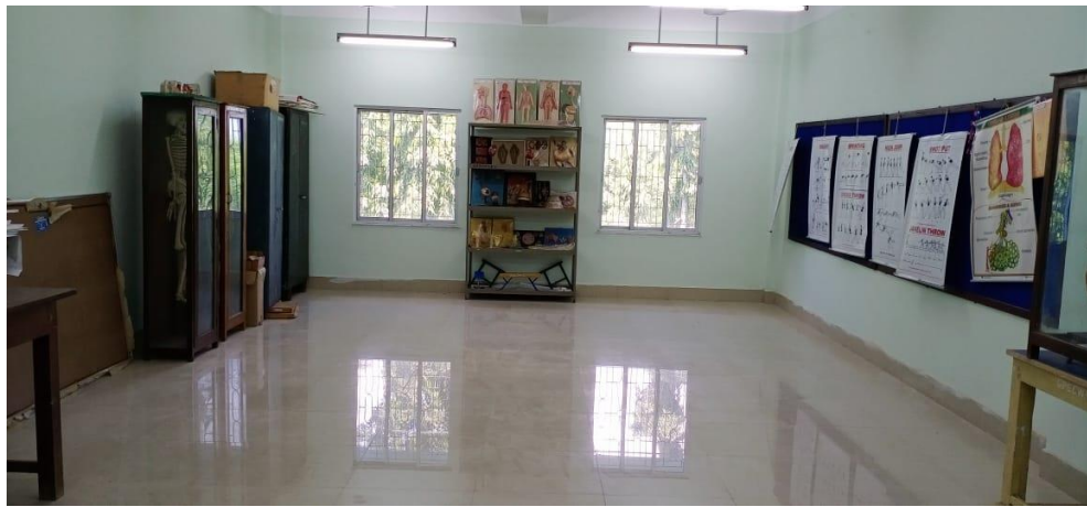
AUDIO VISUAL ROOM-1