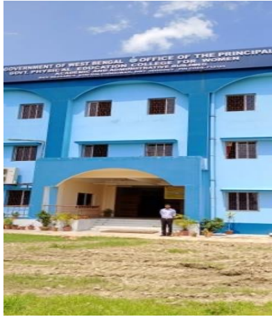
MAIN ENTRANCE OF COLLEGE BUILDING