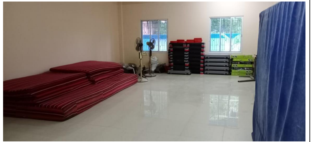
GYMNASIUM - 1