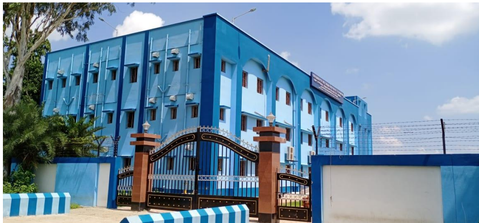
MAIN GATE OF THE COLLEGE CAMPUS